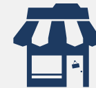
Small Business Support